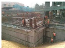
L & T HULIMAVU

Sai Guru Waterproofing Personally Explain to Each Customer the Various Processes, Providing Numerous Choices and Reasonable Rates. They will Insist Upon The Quality and Expect Complete Satisfaction With the Customers They Take a Personal Interest in Customers Waterproofing Problems. The Pride Themselves on Staying Abreast of the latest New Applications Techniques and materials so that they can offer the best possible service to customers.