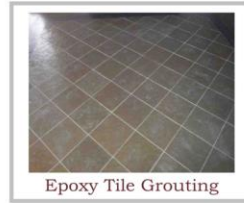
Epoxy Tile Grouting