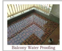
Balcony Water Proofing