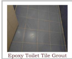
Epoxy Toilet Tile Grout