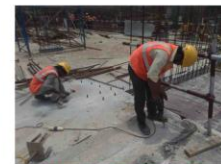
SKY LARK ITHACA