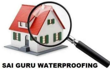
SAI GURU WATERPROOFING

Solution For All Your Water Leakages and Wall Crack Problems