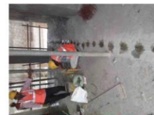
L & T K.R PURAM