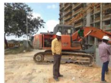
L & T HIRANADHINI