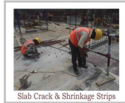
Slab Crack & Shrinkage Strips